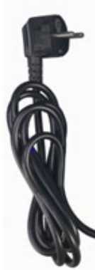
AC cord (must be ordered separately)

Plug options: Europe: CEE 7/7 UK: BS 1363 Australia/New Zealand: AS/NZS 3112